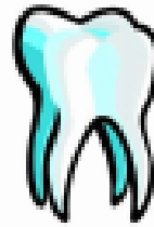
with their teeth